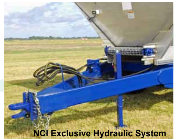
NCI Exclusive Hydraulic System

Manufactured heavier...sturdier and stronger... with more 304 stainless steel... a design that's easier to operate and maintain.