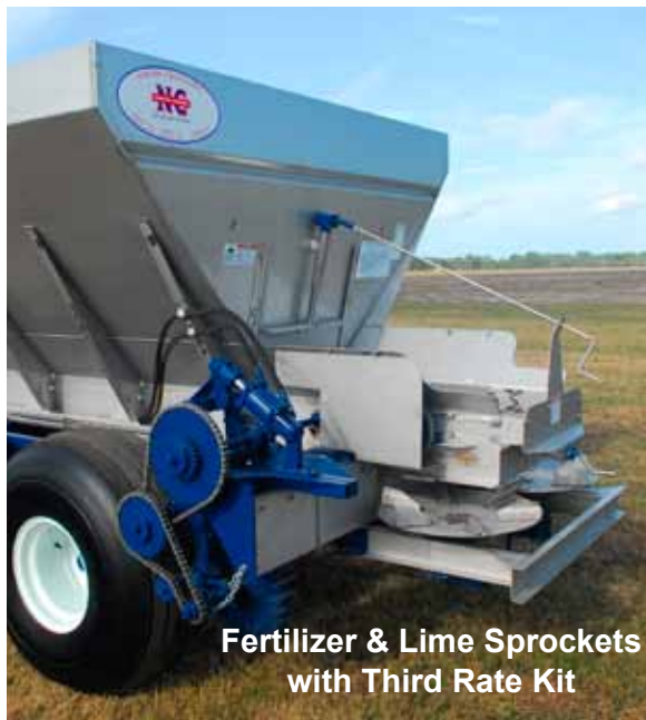
Fertilizer & Lime Sprockets with Third Rate Kit

"I have sowed all my cover crop with it the past 12 years. The spreader has not been touched and nothing has been replaced since new. All we do when finished for the day is rinse the equipment off." North Carolina Grower