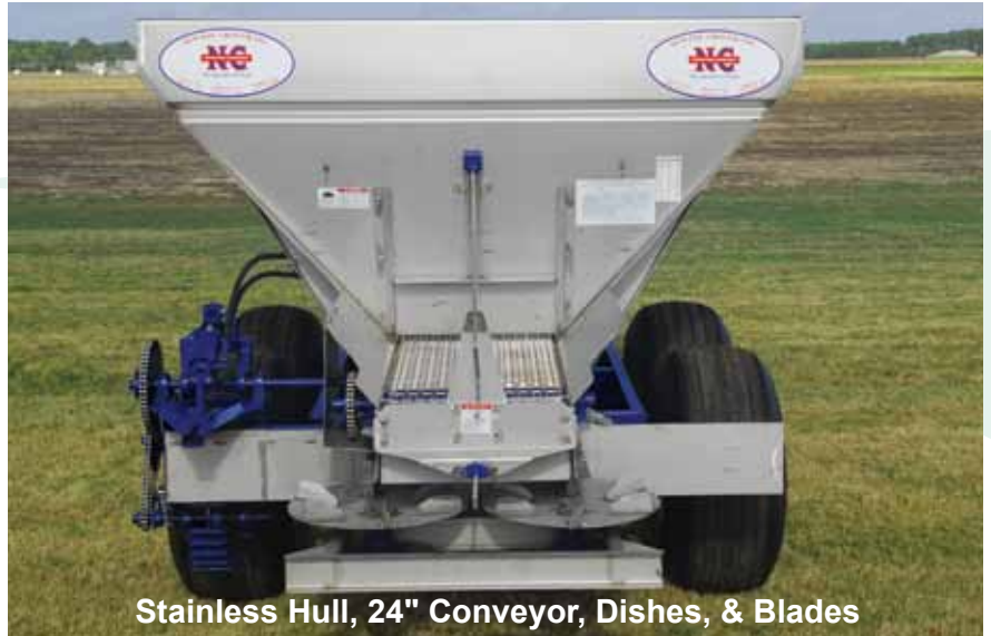
Stainless Hull, 24" Conveyor, Dishes, & Blades

Designed and built stronger to last longer.